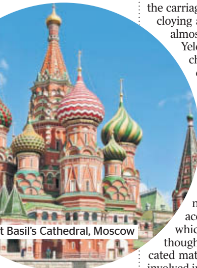
St Basil's Cathedral, Moscow