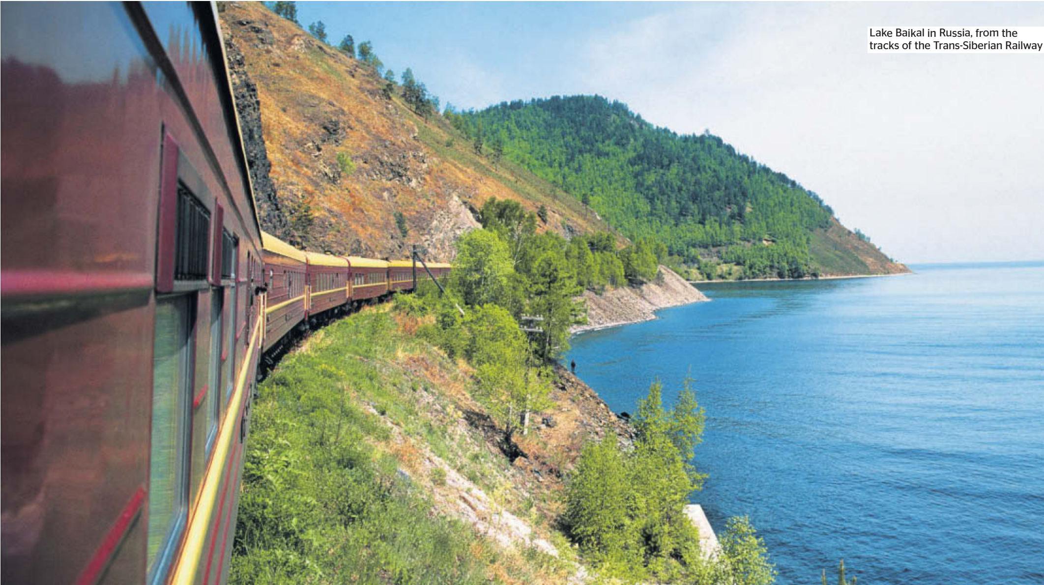
Lake Baikal in Russia, from the tracks of the Trans-Siberian Railway