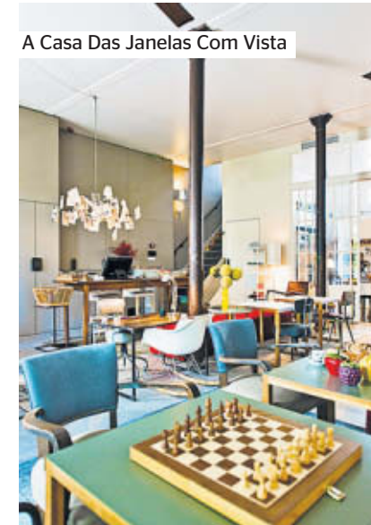
A Casa Das Janelas Com Vista

A small green door is all that marks this cool boutique hotel, nestled in Bairro Alto's labyrinthine alleys. Inside, a narrow staircase descends to an all-in-one living, dining and reception area, with its hotchpotch of quirky furnishings. Continental breakfast is served at a long communal table. Upstairs, the dozen bright rooms are