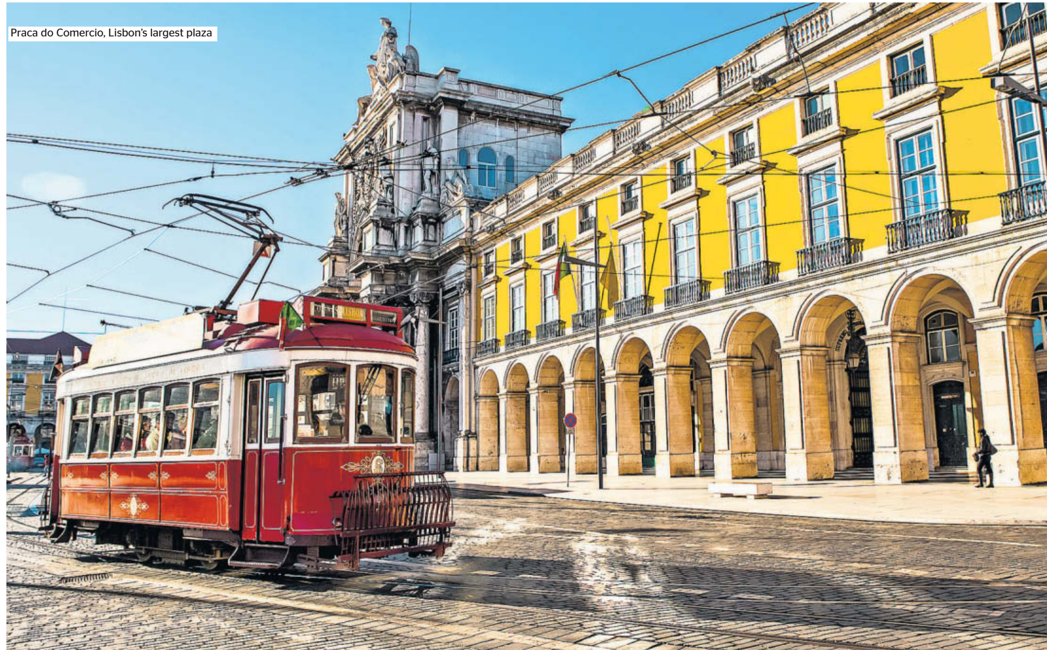
Praca do Comercio, Lisbon's largest plaza

Check into this glitzy, theatre-themed B&B near upmarket Chiado. Tucked